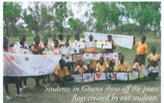
Students in Ghana show off the peace flags created by our students.