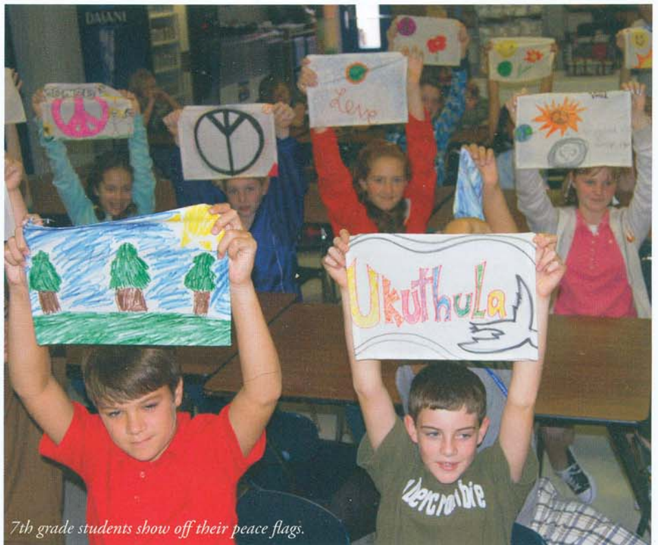
7th grade students show off their peace flags.